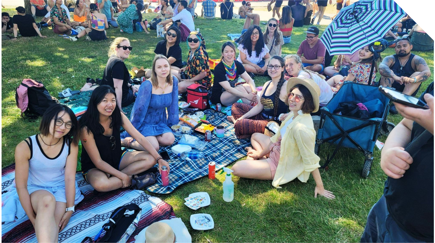
Our Vibrant Community at our DIG Pride Picnic 2022